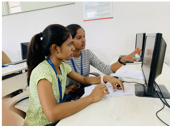
Event Name: Technical Business Ideas