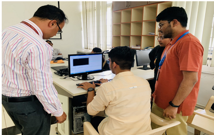
Event Name: C Coding and Debugging