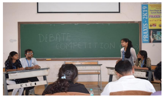
Event Name: Interdepartmental debate competition