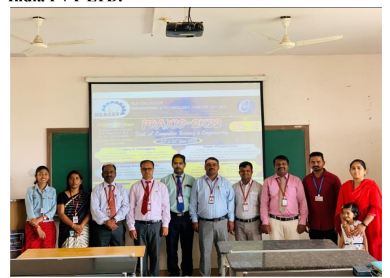
Event Name: National Tech fest 2K22