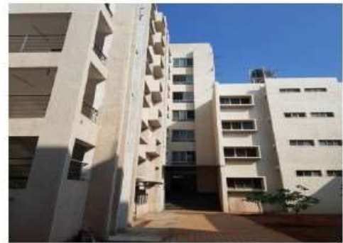
Jr. Boys Hostel