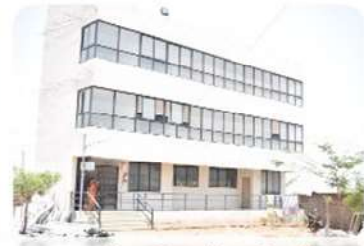
Non Teaching Staff Quarters