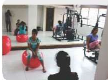
Ladies Fitness Club