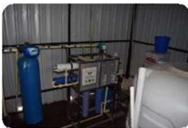
RO Water Plant