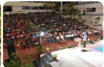
Open Air Theater