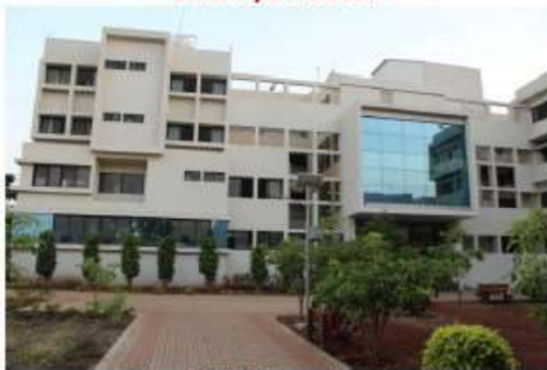
Sr. Girls Hostel