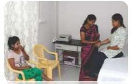
First Aid cum Sick Room