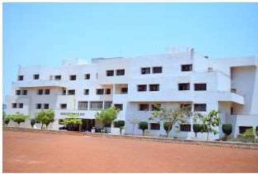
Sr. Boys Hostel