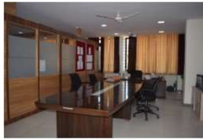
Head of Department Room