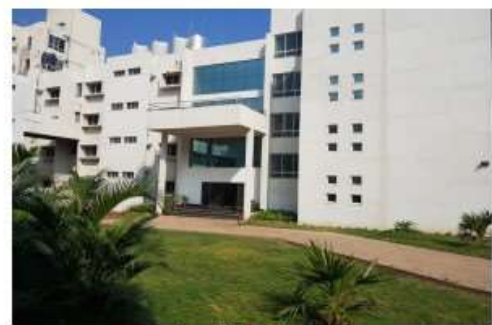
Jr. Girls Hostel